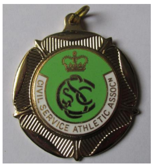
1992 Indoor T&F 1992 T & F