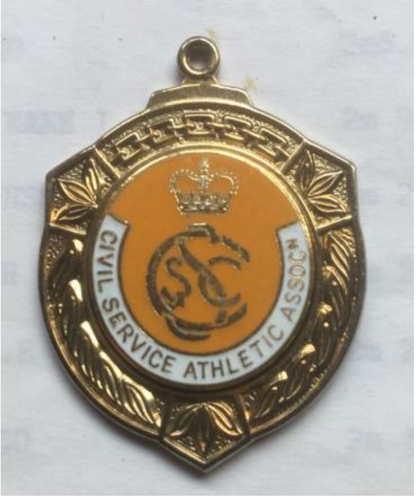
Early 1986 Late 1986