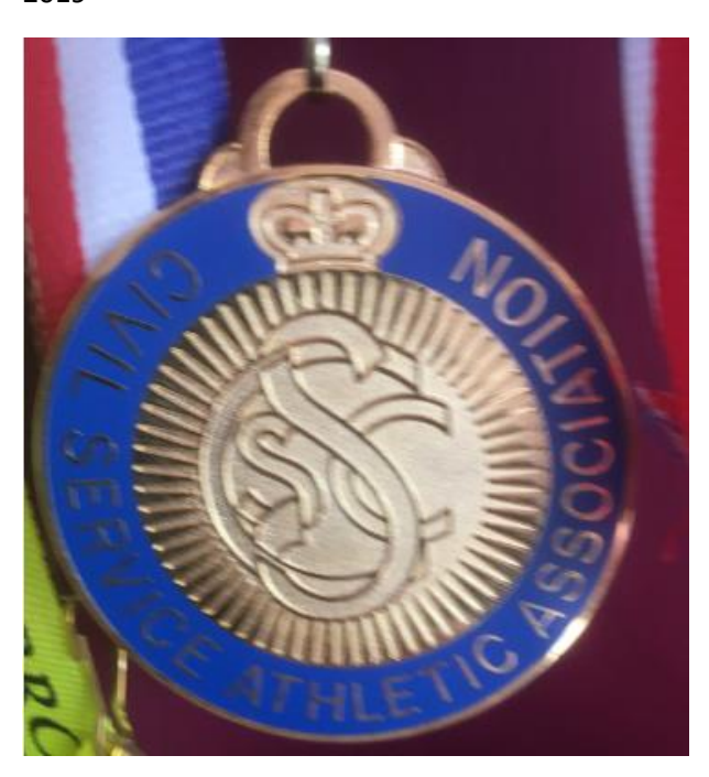
In Commemoration of the Olympic Games 2012 Committee Medal